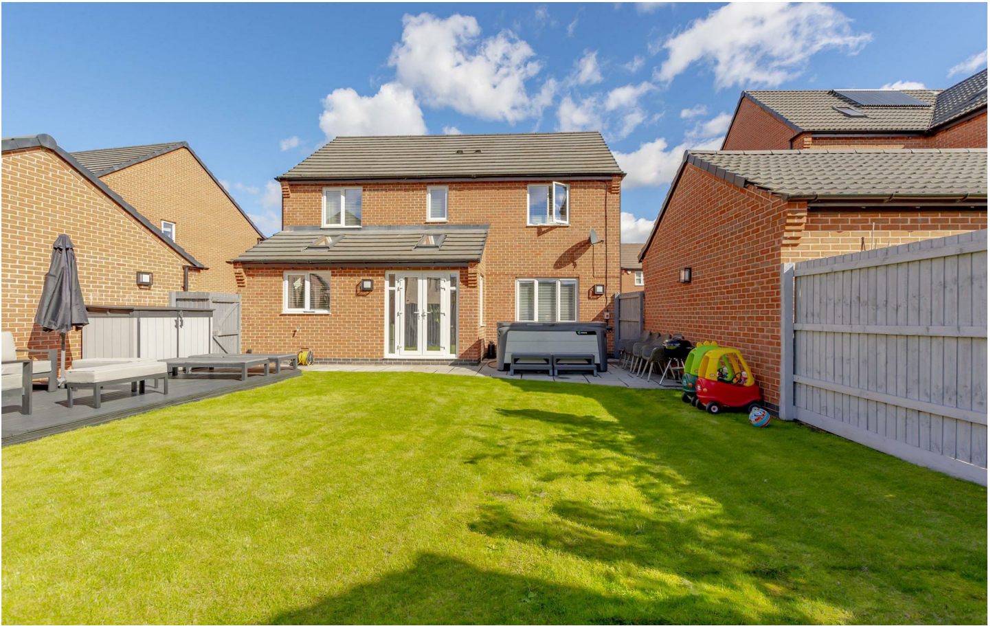
AN IMMACULATE FOUR BEDROOM DETACHED FAMILY HOME SITUATED IN A CUL-DE-SAC LOCATION.

Robert Ellis are delighted to bring to the market a property that is just five years old, originally built by Wimpey Homes and is The Laughton design. The property is situated within walking distance of Challaston Park and is in the catchment of Challaston Academy. Offering spacious accommodation throughout, the light and airy property is ready for its next family to move into. A particular feature is the breakfast kitchen facing onto the garden and having velux windows to the ceilings offering lots of light with the property being south facing. Having fantastic road network links such as the A50 and recently constructed Enterprise Way linking to Rolls Royce, an internal viewing is a must to fully appreciate all the accommodation has to offer.